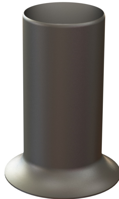
* Special length shown

A bell-mouth may also be referred to as a suction bell-mouth. A bell-mouth may be used in gas or liquid applications and is typically placed on the inlet. When placed on the outlet they may be referred to as a diffuser. Bell-mouths are commonly incorporated into a pulsation dampener or anti-surge tank design which contain one or more choke-tubes. The bell-mouth configuration reduces entrance pressure losses as the gas or liquid enters into the pipe in which the bell-mouth is attached. This is accomplished because the shape of the bell-mouth results in a low resistance coefficient which is also called the K factor. The K factor is one of the variables used in determining entrance and exit pressure drops.