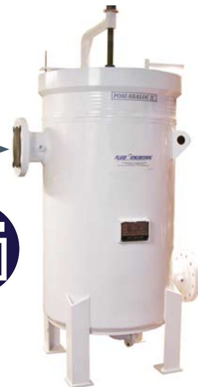
Liquid Filtering Model 120 Basket Strainer or Model 132 Convolute Basket Strainer with POSI-SEALOC II™ cover